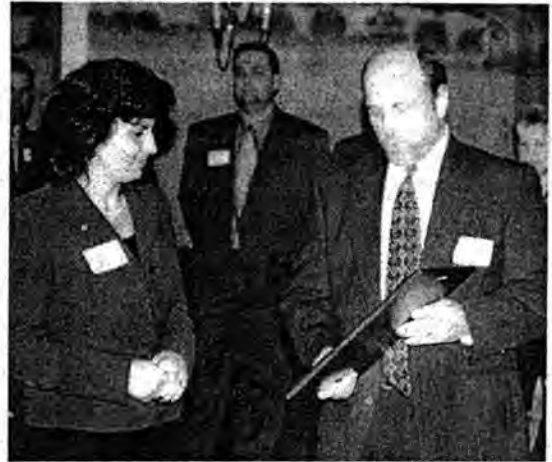
Representative Paula Dockery

an additional $20 million for aquatic plant control. When combined with existing recurring revenues, funding will finally be sufficient to address invasive plant problems in all public waters.